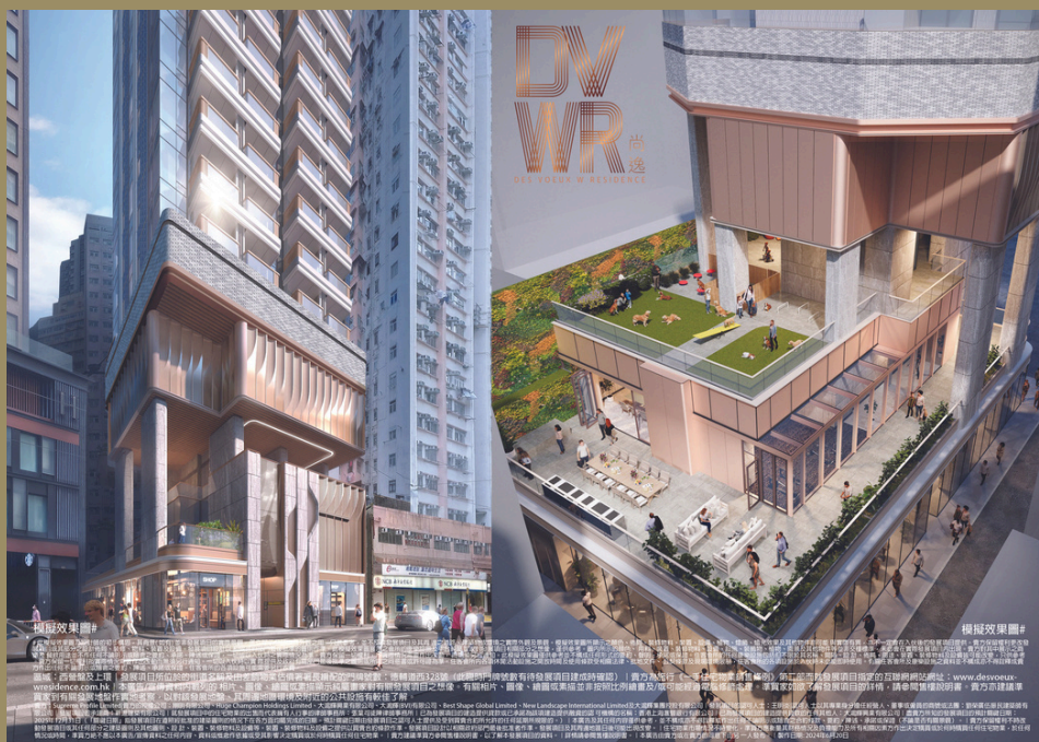
DVWR, Sai Ying Pun