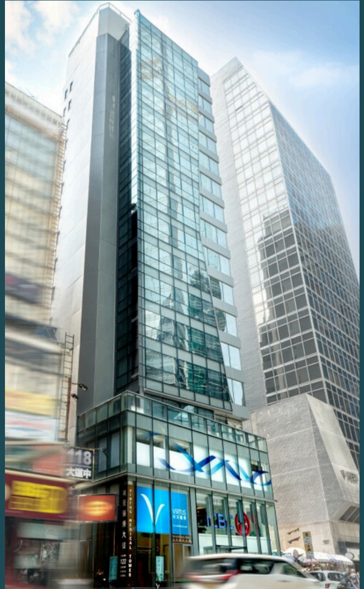
Virtus Medical Tower, QRC, Central