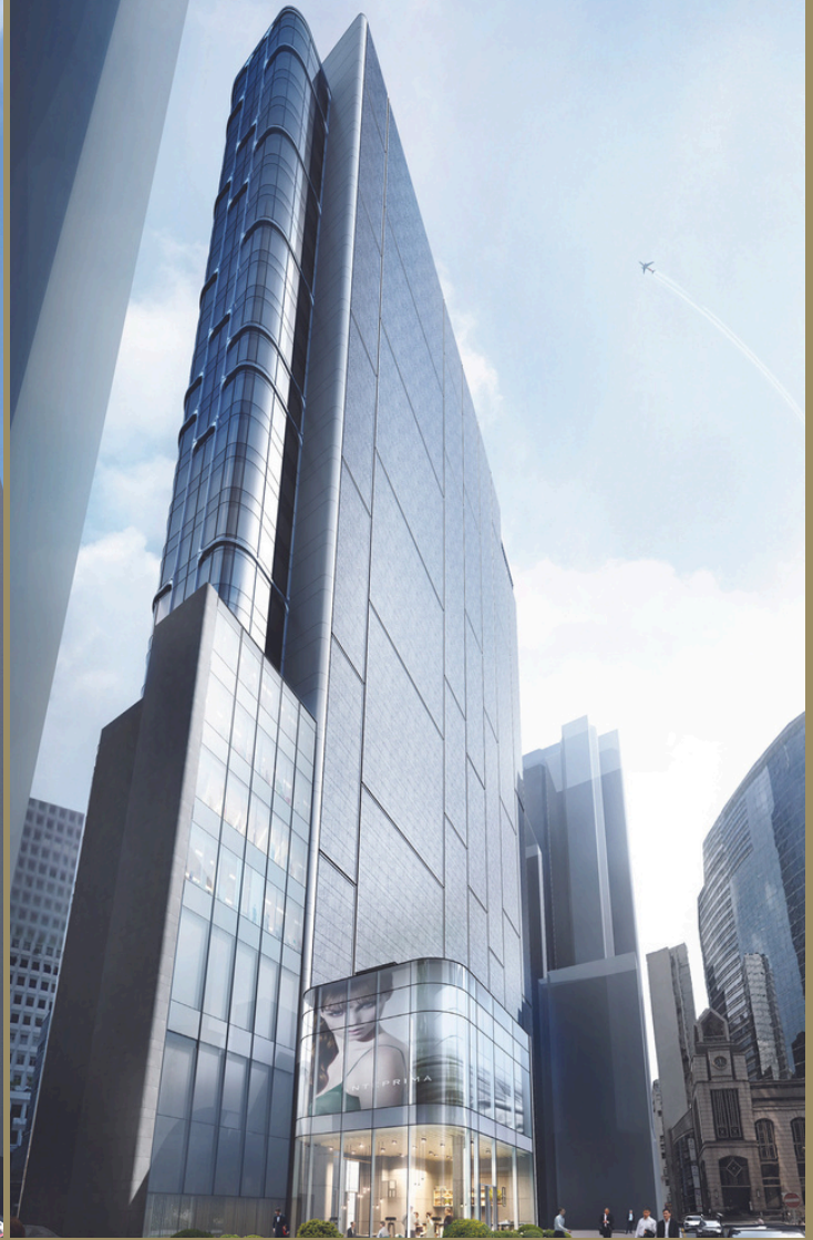
212-232 Des Voeux Road Central