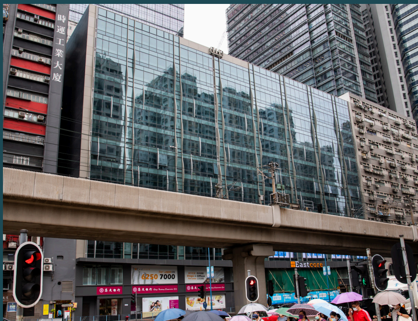
Eastcore, Kwun Tong