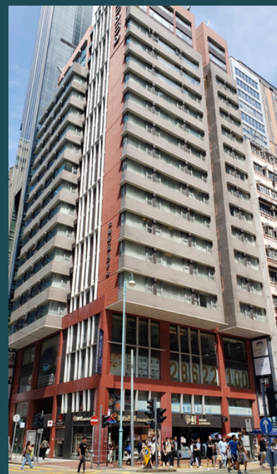
Shama Fortress Hill