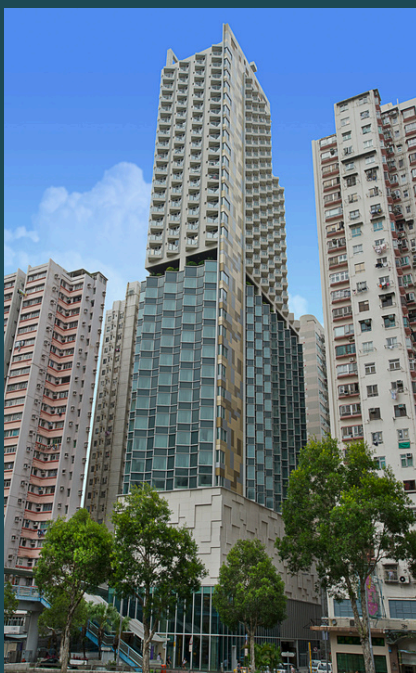
Holiday Inn Express, Mong Kok / One Dundas