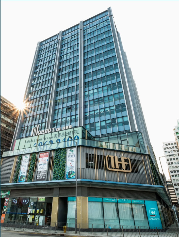
Magnet Place (Twin Towers), Kwai Fong