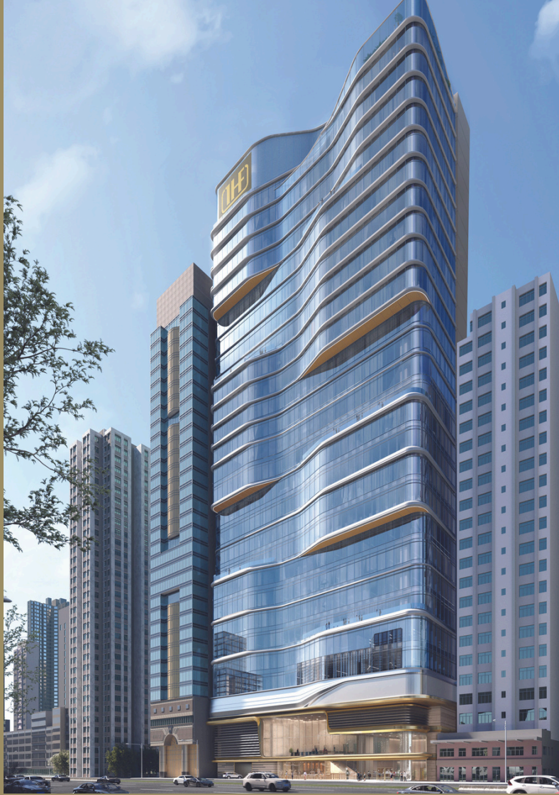
92-103 Connaught Road West