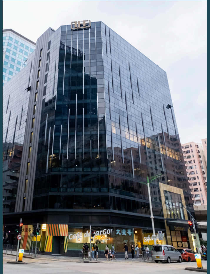
Eastmark, Kowloon Bay