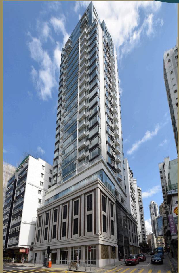
Kadoorie Lookout, Homantin