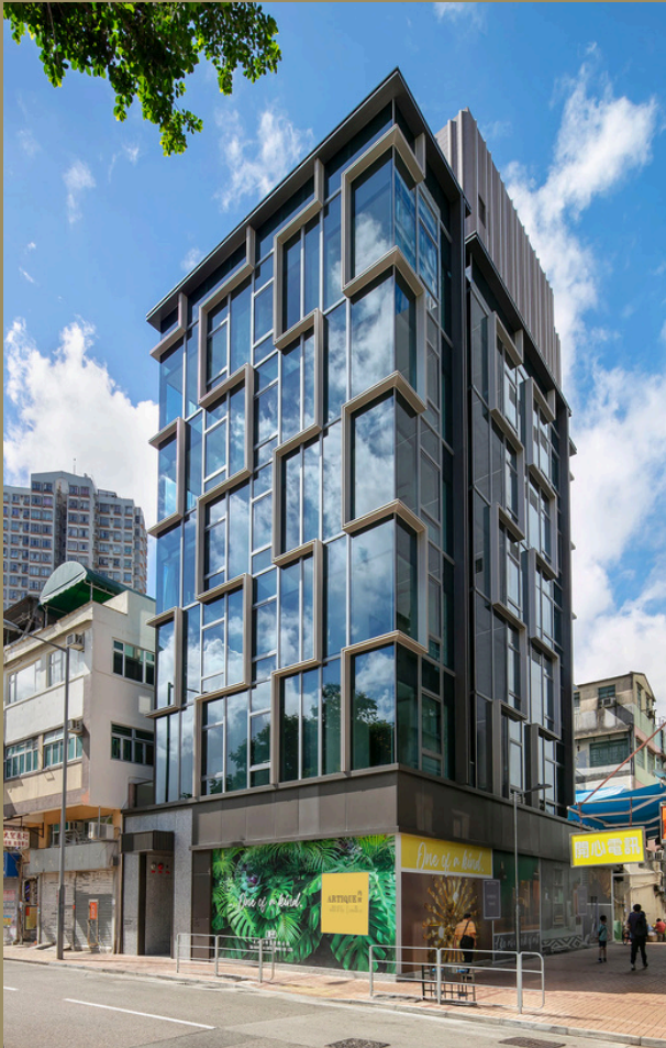
Artique, Sheung Shui