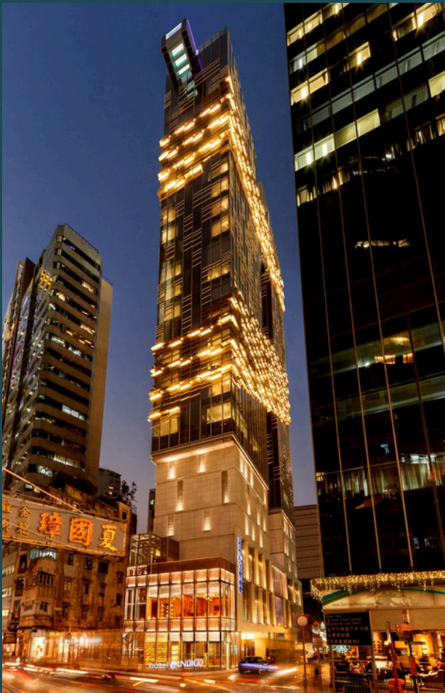
Hotel Indigo, Hong Kong Island