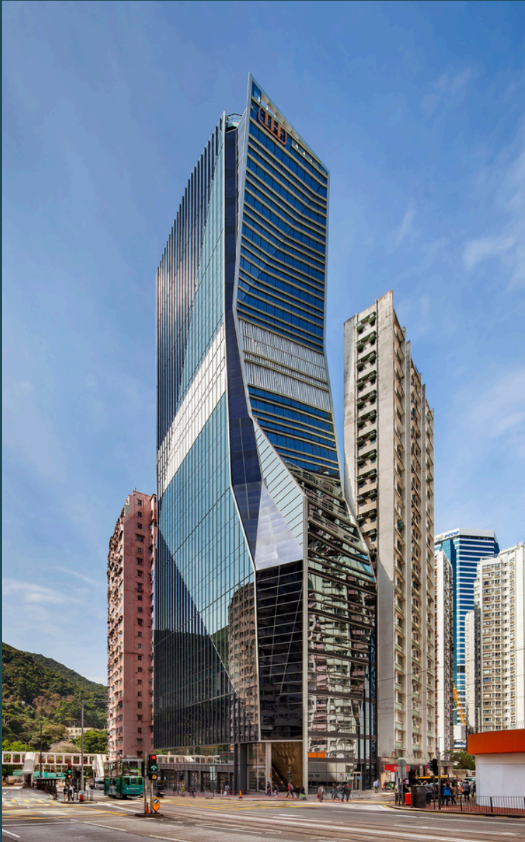
1001 King's Road, Quarry Bay